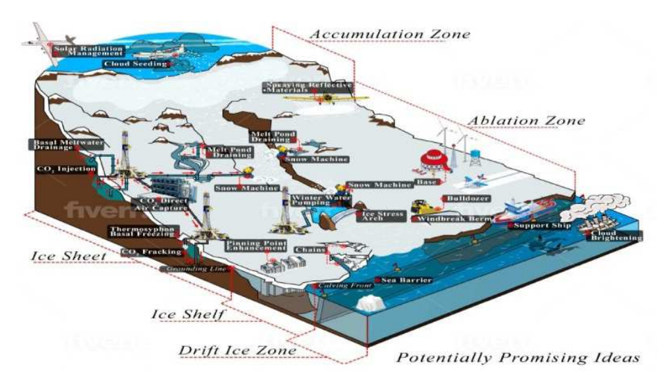
Figure 2: Schematic Re Presentation of Glacier Intervention Engineering Schemes.